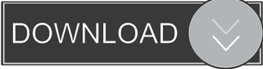
Autodesk Rendering 2015 Scaricare Crepa 64 Bits